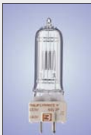
CODE 862 CODE 326 CODE 683 CODE 648